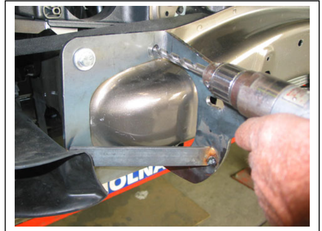
Figure 2: Drill four holes to 10mm (per side)