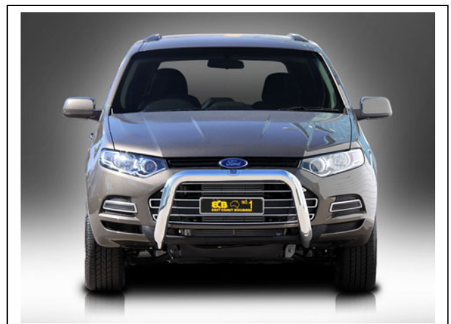
Figure 6: 76mm Nudge Bar front view