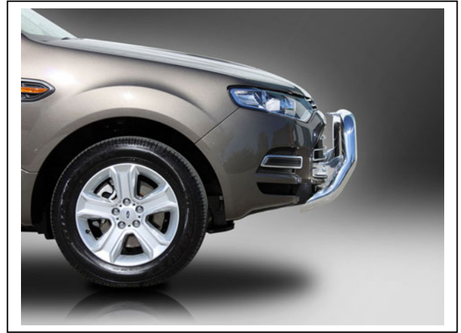
Figure 8: 76mm Nudge Bar side view