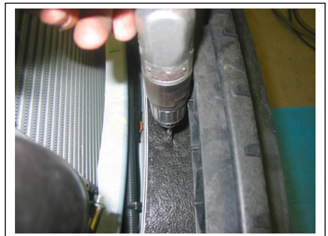
Figure 4: Drill top of polystyrene foam bumper support