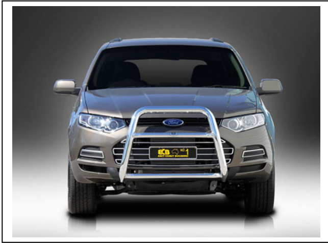
Figure 7: Series 2 Nudge Bar front view