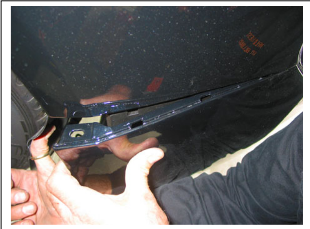
Figure 1: Pull bumper rearward and out to release.