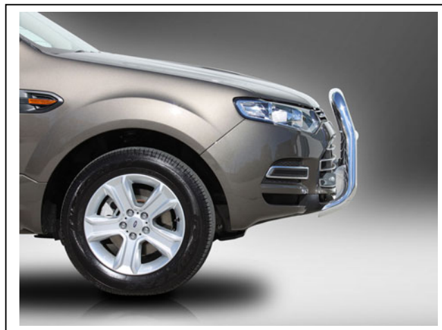
Figure 9: Series 2 Nudge Bar side view